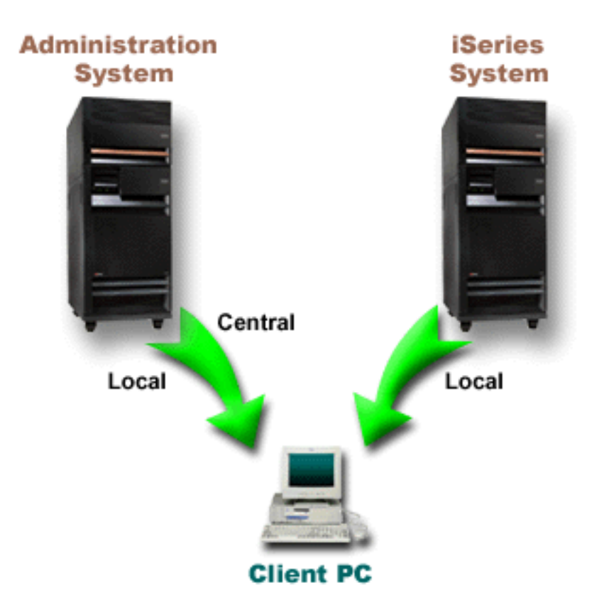
Figure 1. When a Client PC connects to a system, the Local Settings come from the system that you connect to. When you connect to an administration system, the Central Settings are sent to your Client PC from the administration system.

On the administration system, you may select the Local Settings . These settings allow or deny access to administrable functions. The administration system's Local Settings only apply to the administration system.